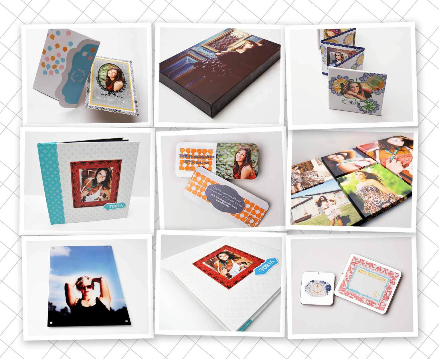
senior product catalog